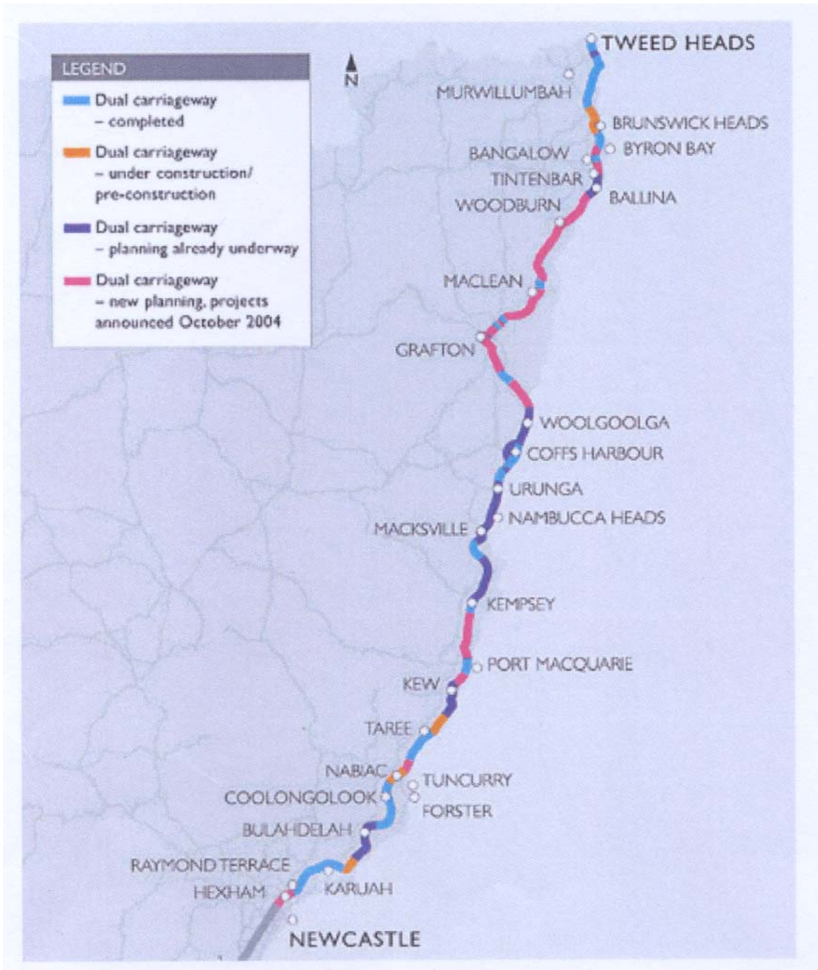
Figure 1 Pacific Highway – Tweed Heads to Newcastle

Note: All maps are sourced from the RTA website www.rta.gov.au/ .